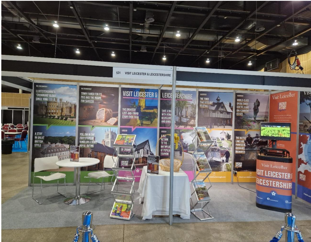
Group Leisure &amp; Travel Show Oct 2022

Shopping in Ashby de la Zouch Best Western Premier Yew Lodge Hotel Hastings Retreat